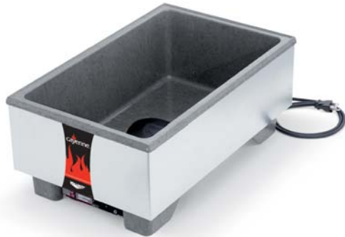
Cayenne® Full-Size Heat 'N Serve Rethermalizers