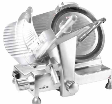
HBS-300L - 12" Slicer