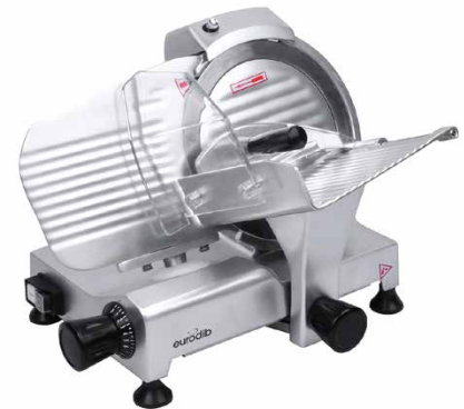
HBS-220JS - 9" Slicer