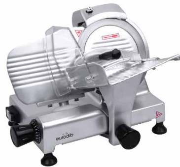
HBS-195JS - 8" Slicer