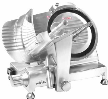
HBS-250L - 10" Slicer