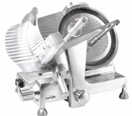
HBS-350L - 14" Slicer