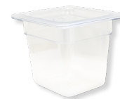
MEGA TOP | 24 X 1/6 PAN