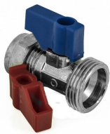
3/4 shut off valve max 125F (55C)