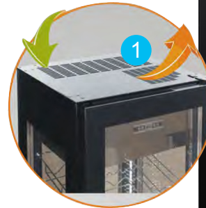
Cold and hot air exchange on top