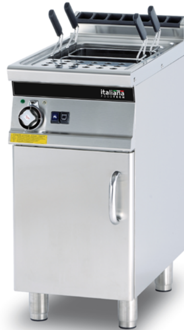
E74W Automatic Water Filling