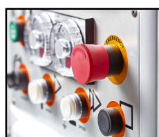
User-friendly at all times