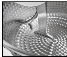
Bowl And Spiral