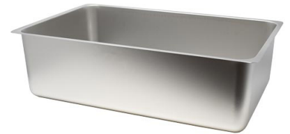
Spillage pan (80907)